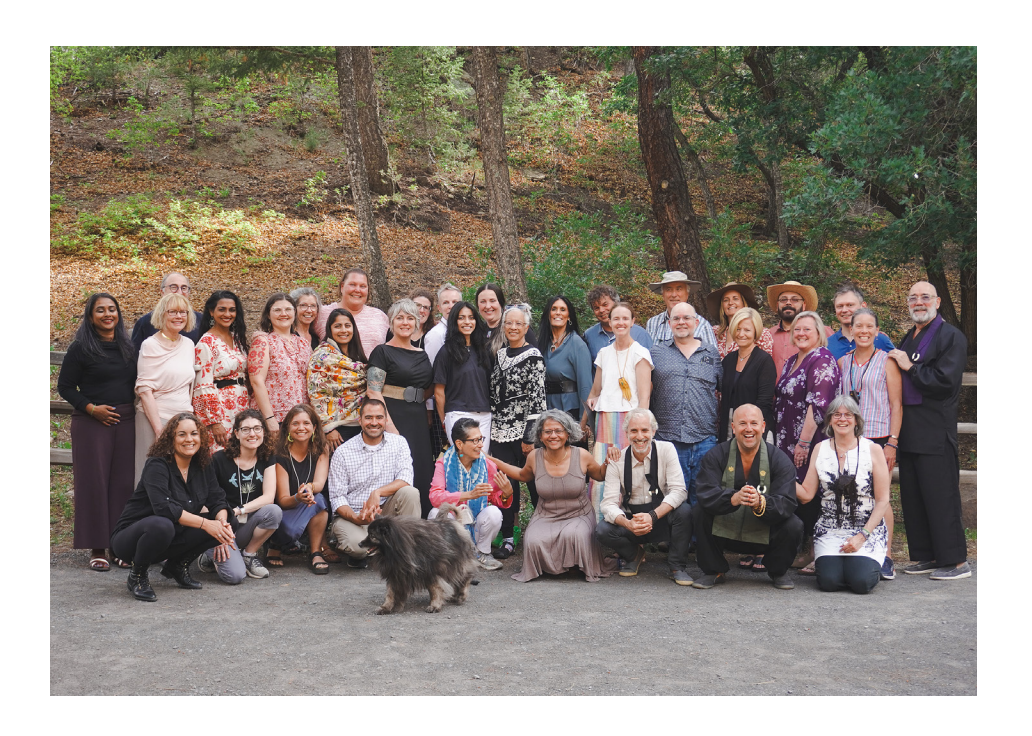
2021-22 FELLOWSHIP COHORT

Please note that retreat and travel costs are not included in the Fellowship tuition.