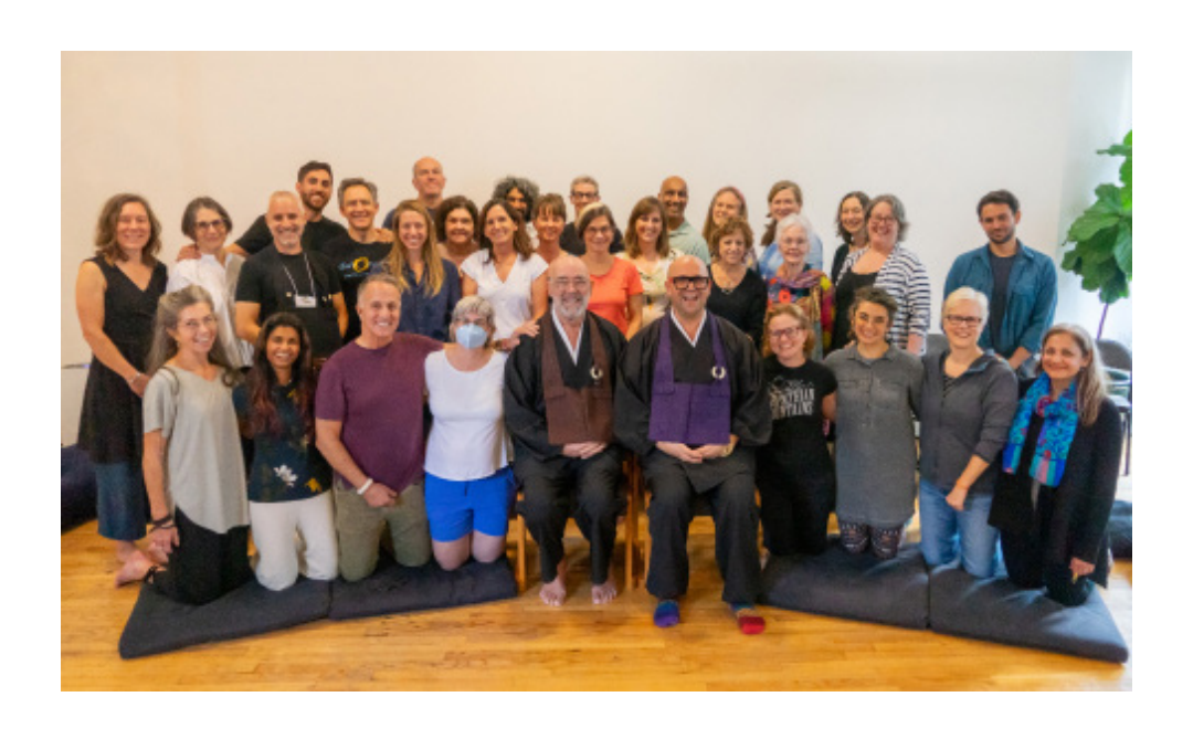
2023-24 FELLOWSHIP COHORT

Visiting Faculty Sessions occur on the first and third Wednesdays of the month, 7:30–8:45 p.m. ET via Zoom with exceptions for holidays.